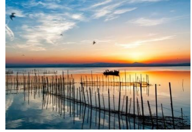
Albufera de Valencia