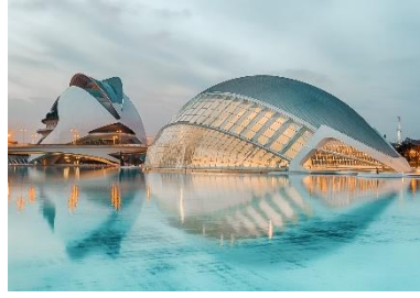
City of Arts and Science