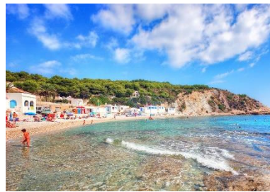
Cala Portitxol in Jávea