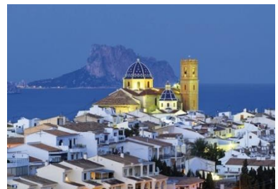
Altea's City Center