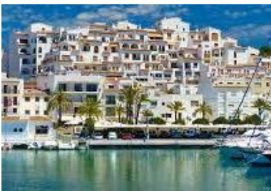
Moraira's City Center