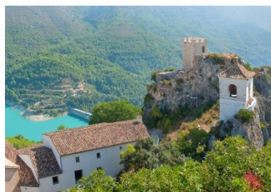
Castell de Guadalest