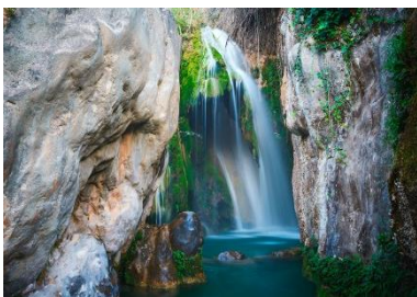
Las fuentes del Algar