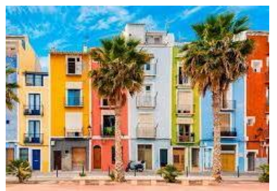
Villajoyosa's City Center