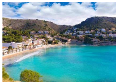
Cala El Portet in Moraira