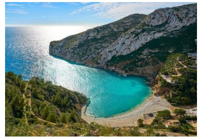
Cala de la Granadella in Jávea