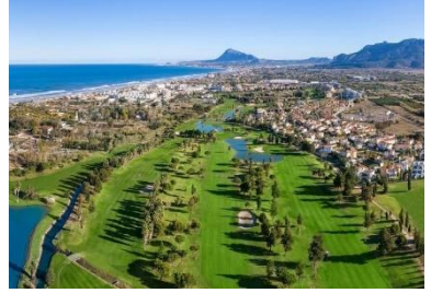
Oliva Nova Golf Resort