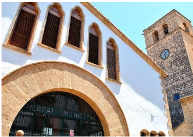
Jávea's Historic City Center