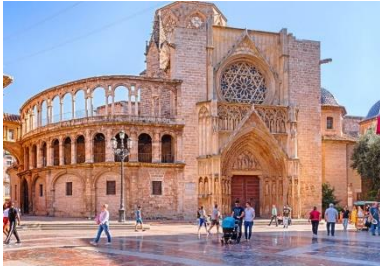
Valencia's Historic City Center